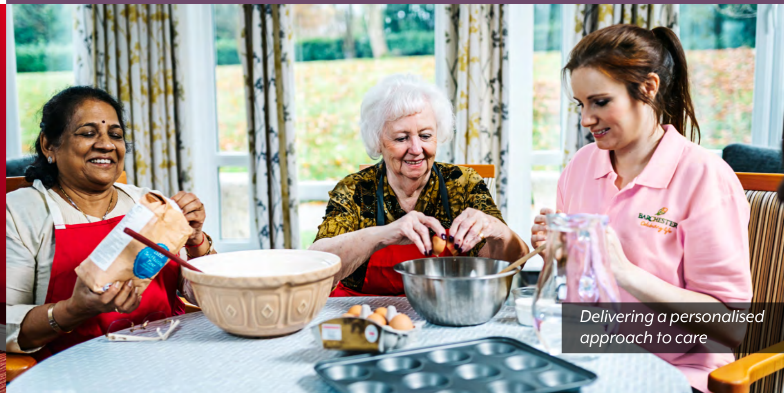
Delivering a personalised approach to care